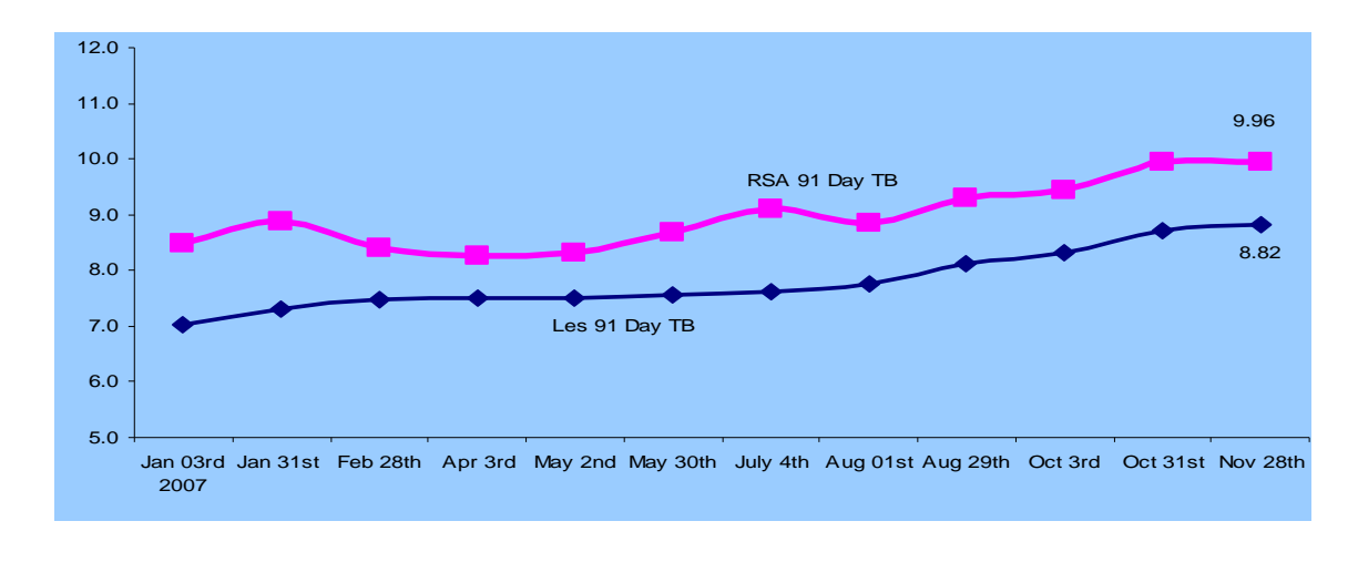
Figure 2: Measuring the Success of Monetary Policy Objectives

increase in December. The Lesotho 91day treasury bill rate fell by 8 basis points to 8.82 percent. The counterpart SA rate also increased from its previous level of 9.94 per cent in October to 9.96 per cent in December. Consequently, the margin between the two rates increased from 51 basis points to 114 basis points at the end of the review period, as depicted in Figure 2 below. The level of net international reserves remained above the CBL target of US$450-500 million. Thus the monetary policy operations were deemed successful in achieving the desired level of external reserves.