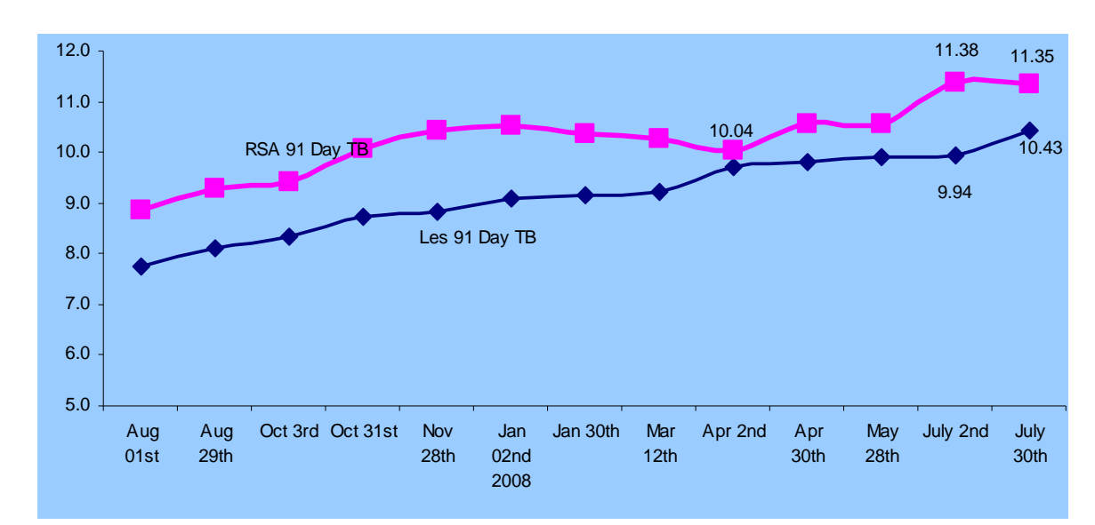
Figure 2: Measuring the Success of Monetary Policy Objectives

Table 5: Selected Monetary and Financial Indicators