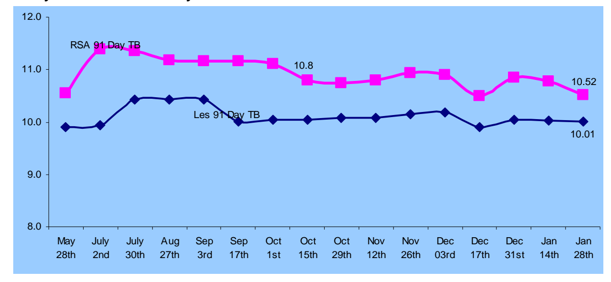
Figure 2: Measuring the Success of Monetary Policy Objectives: Performances of Lesotho 91-day T-bills vs RSA 91-day T-bills

cross border transfers of funds between the two countries. Hence, Monetary Policy operations undertaken during the review month were successful in attaining their desired objectives of financial stability by maintaining the target NIR level.